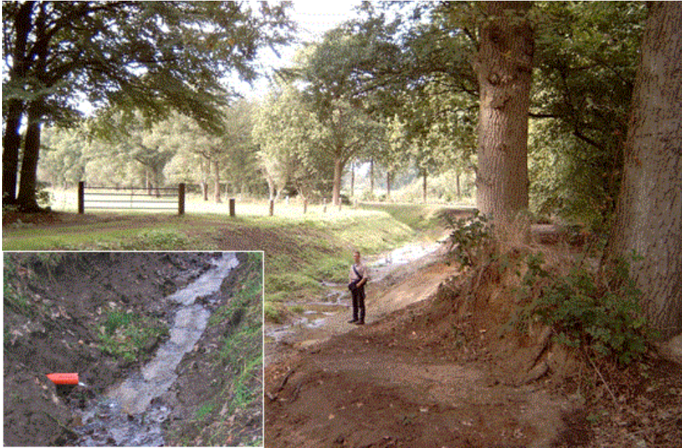
Figure 2: Rivers run dry due to extensive tile drainage and over dimensioned ditches.