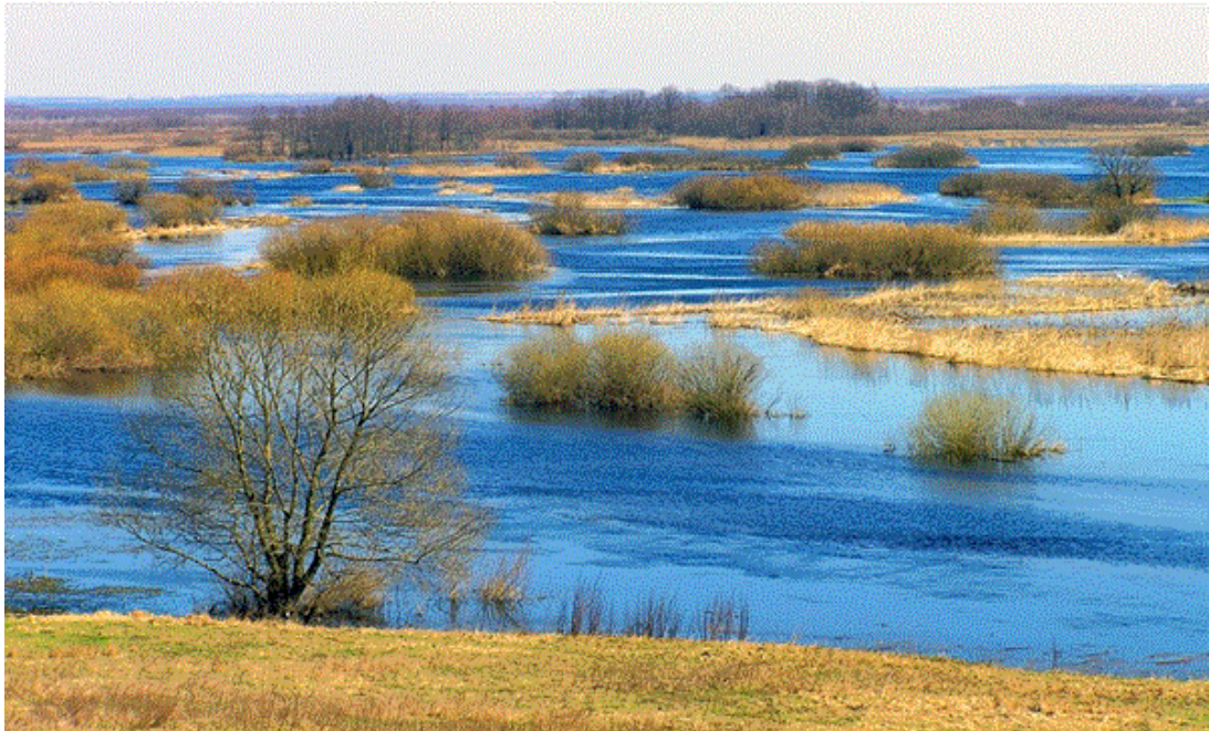
Figure 3: Wetlands and floodplains in the valley of the Biebrza River